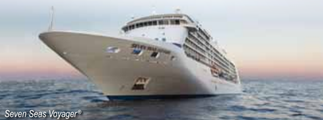
Seven Seas Voyager ®

JUST A DEPOSIT REQUIRED TO SECURE YOUR PREFERRED SUITE THEN NOTHING TO PAY UNTIL NEXT YEAR