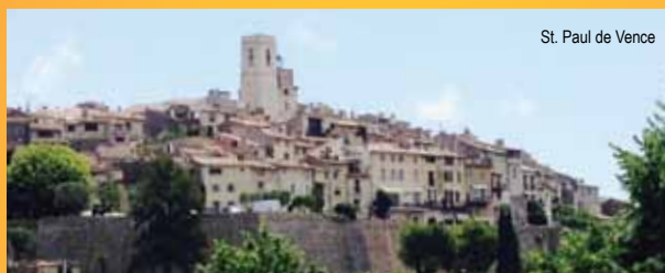
St. Paul de Vence