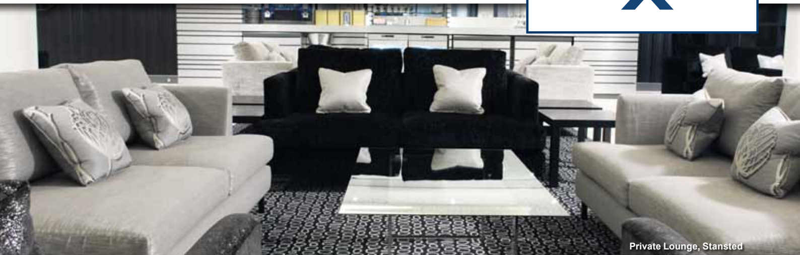
Private Lounge, Stansted